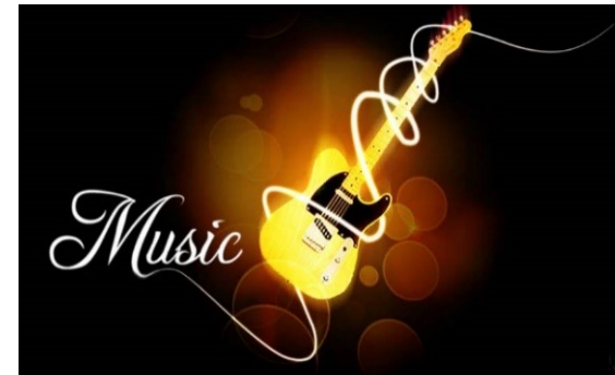
Integration of Client Selected Music