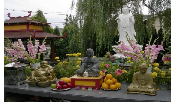
Incorporation of Valued Rituals